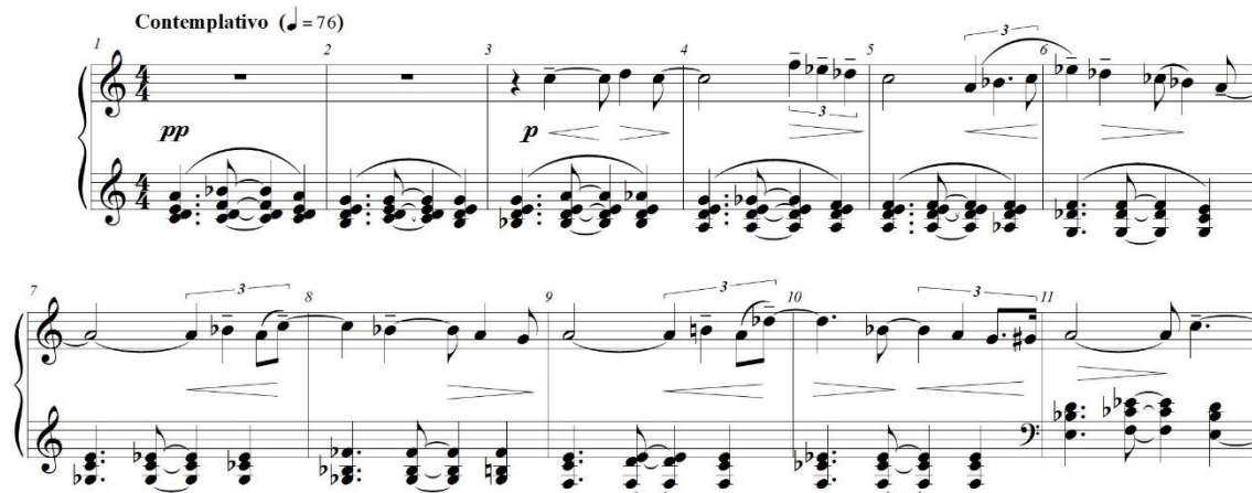
Figura 4: The initial gestures of Guarnieri's Ponteio No.7

The textural profile of the work was analyzed with Parsemat , a computer application created by Pauxy Gentil-Nunes (2009) 8 that can perform a detailed partitional analysis 9 of a MIDI file providing as an output an indexogram 10 , a partitiogram 11 , and the entire list of partitions. Tables 3 presents the partitions, as well as, the density-number ( dn ) for each measure of Guarnieri's Ponteio No.7 . The calculation of the deh for the entire piece was executed manually and it is also presented in the same table.